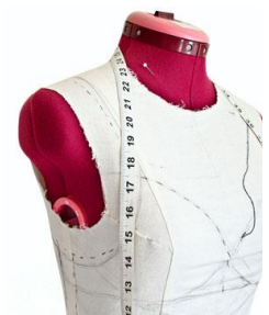
Monday 2 nd December

Come in the morning 9.45am – 12.45pm or in the afternoon 1.15pm – 4.15pm.