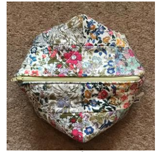
Friday 25 th October