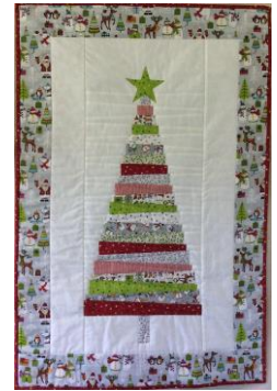
Saturday 26 th October

Christmas Tree wall hanging with Jan Otty. This fun wall hanging is easy to sew, but, will need concentration! Kits of fabric will be available from the shop or it could be made from scraps. There will be some cutting out homework before the workshop. Finished size 24" x 36". Machine sewn only. All Day 10.00am – 4.00pm.