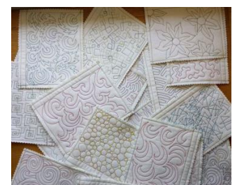
Saturday 7 th December

Machine Quilting Part 2 with Lucy Brennan and Alison Forbes. Plan your quilting and put it into practice. In this second class we will expand on basic quilting patterns and will cover the use of stencils, marking, joining "quilt as you go" and practise free motion quilting. You can bring a quilt top to the class (optional) and leave feeling confident about the quilting. The two day course will give you confidence in your quilting. Machine Sewn. All Day 10.00am – 4.00pm.