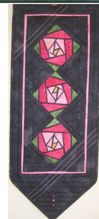
Friday 22 nd November