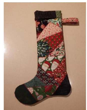
Friday 11 th October

'Peek a boo' washbag with Helen Dudgeon. A quick and easy toiletry or make up bag perfect for travelling, or great as a gift. A Half Day Course 10.00am – 1.00pm.