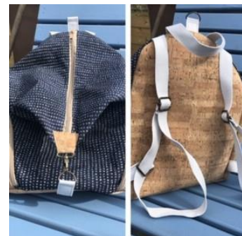
Friday 15 th November