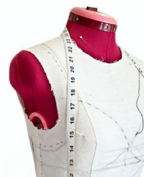
Monday 16 th September

Full payment will be taken on Booking. If you have to cancel a course, and tell us more than 7 days before the course you will receive a refund of £20 for a full day and £7.50 for a half day. If you tell us within 7 days of the course taking place, you will not be entitled to any refund.