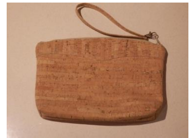
Saturday 28 th September

Cork Clutch Bag with Judith Henshaw. Have a go at sewing with cork fabric. An attractive fabric made from real cork that comes from the bark of a tree. It is a sustainable product and is backed with a cotton fabric to give it stability. Cork fabric can be used very successfully as an alternative to leather so it's great to use for making bags and purses as it is waterproof, soft to handle, stain-resistant and vegan too! The other fabulous things about cork are that you don't need interfacing, you don't need to press it and you can leave the edges raw as there is no fraying with cork! This bag is fully lined to give it a smarter finish. Machine sewn. Approximate size 11.5" x 8.5" (29cm x 21.5cm). All Day 10.00am – 4.00pm.