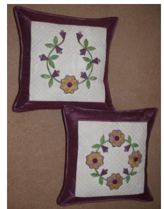
Thursday 5 th December

Baltimore Style Cushion with Anne Gosling. Choose from one of two designs to make a Baltimore style cushion using the technique of hand applique. A good introduction to needle-turn applique. Hand Sewn. All Day 10.00am – 4.00pm.