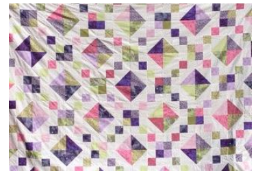
Friday 29 th November