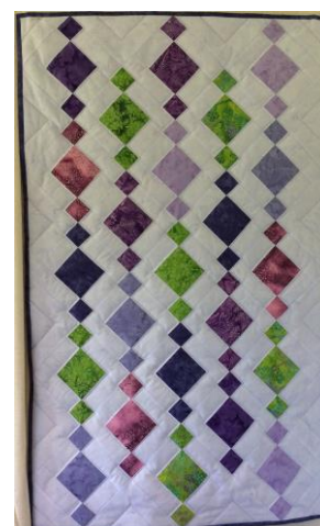
Saturday 16 th November