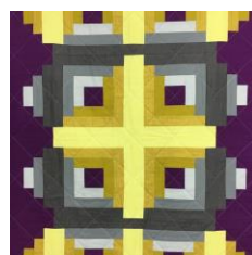
Saturday 21 st September