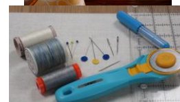
Saturday 19 th October