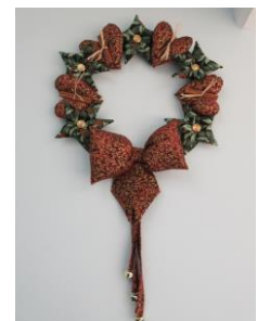
Friday 8 th November

Machine Sewn. Suitable for all levels, All day 10.00am – 4.00pm.