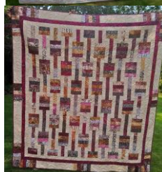
Friday 27 th September