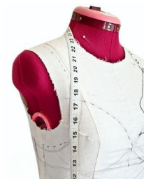
Monday 14 th October

Come in the morning 9.45am – 12.45pm or in the afternoon 1.15pm – 4.15pm.