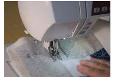
Saturday 30 th November