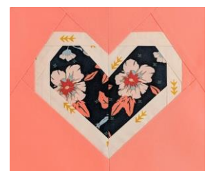
Saturday 9 th November

"All about foundation paper piecing" with Lucy Brennan. Lucy will demystify foundation paper piecing! Exploring different methods we will address how to prepare the fabric and blocks, with tricks to simplify piecing. Simple patterns will be provided but you may also bring patterns you would like to sew with you. Suitable for all levels. All Day 10.00am – 4.00pm