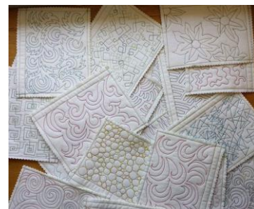
Saturday 12 th October

Machine Quilting Part 2 with Lucy Brennan and Alison Forbes. Plan your quilting and put it into practice. In this second class we will expand on basic quilting patterns and will cover the use of stencils, marking, joining "quilt as you go" and practise free motion quilting. You can bring a quilt top to the class (optional) and leave feeling confident about the quilting. The two day course will give you confidence in your quilting. Machine Sewn. All Day 10.00am – 4.00pm.